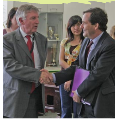
Australian Statistician Dennis Trewin meets with Space-Time Research CEO Warren Richter.

The result of this will be intuitive, easy-to-use web-based navigation, with the coverage of topics and selection of different geographic areas for the different levels of Census user expertise. The new online products will be a readily available and accessible range of Census data with useful data tables, designed and developed to