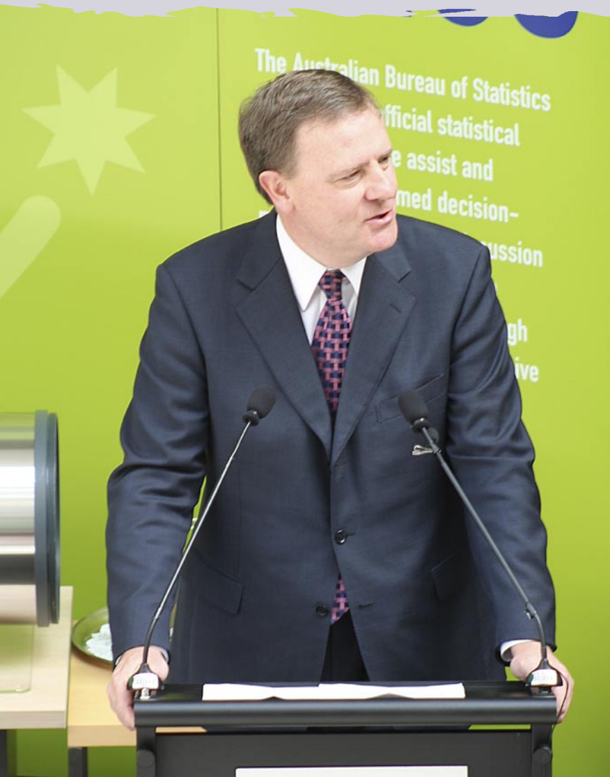
Treasurer Peter Costello announcing the entire content of the ABS web site will be accessible free of charge.

The ABS reached an important milestone in dissemination of statistics in Australia with the Federal Treasurer, the Hon. Peter Costello, announcing that the entire content of the ABS web site www.abs.gov.au will be accessible free of charge via the Internet from Monday 12 December 2005.