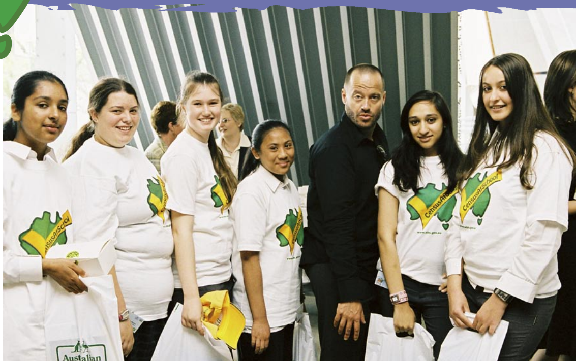
Keynote speaker Adam Spencer meets with school students at the CensusAtSchool launch.

CensusAtSchool, a major ABS initiative in online education, was launched at the Melbourne Museum on October 20. The project, is free, voluntary and open to all Australian schools.