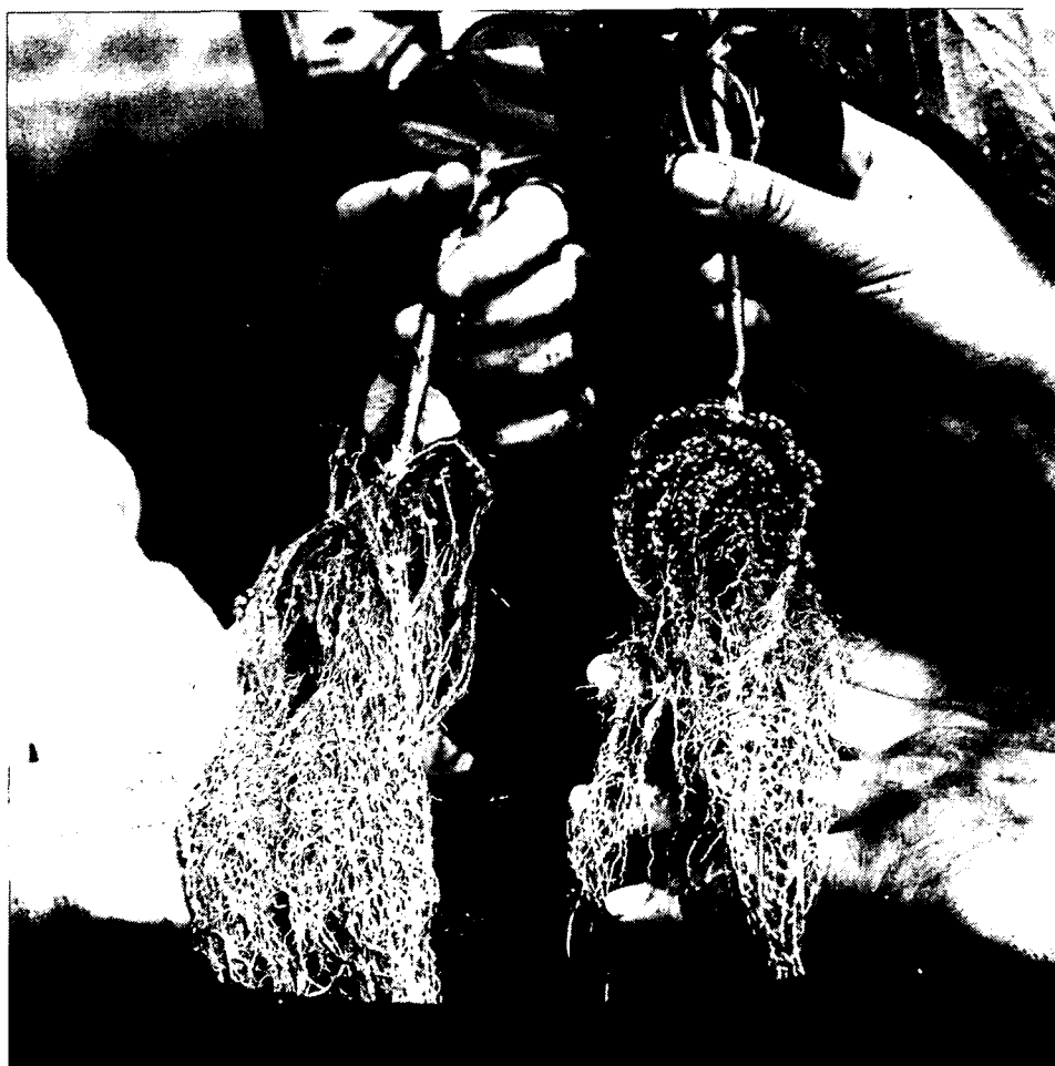
Scientists at the Australian National University have developed a genetic mutant of the soybean which grows a 'super nodulating' root system and increases the plant's ability to fix nitrogen. The 'super nodulation' root system is on the right. It has a more expansive and abundant root system than the untreated plant shown on the left.

These organisations play an important role in promoting communication between the Higher Education and other sectors. They undertake investigational and research projects and provide consultancy, technical information and testing services in a range of fields including engineering, management, marketing and the social sciences.