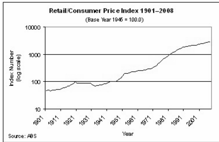
Figure 3.1: Graph of long-term Retail/Consumer Price Index