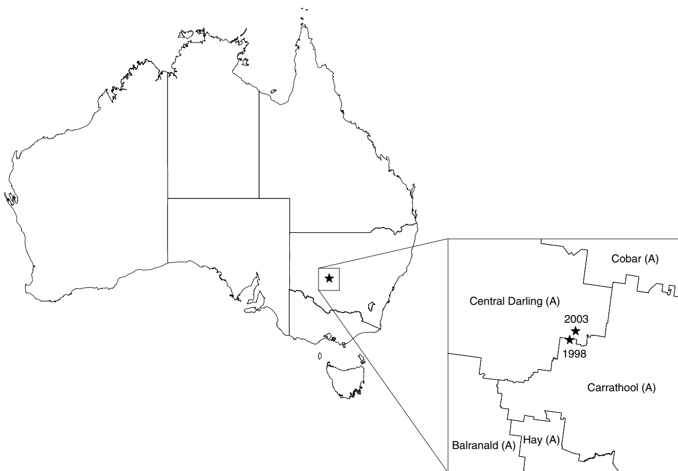
CENTRE OF POPULATION, Australia—June 1998 and June 2003

Between June 1998 and June 2003 the centre of Australia's population moved around 6.8 kilometres north-eastward, from within the LGA of Carrathool (A) to the LGA of Central Darling (A), as a result of population growth in northern Australia.