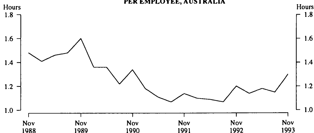
CHART 7.2. AVERAGE WEEKLY OVERTIME HOURS PER EMPLOYEE, AUSTRALIA